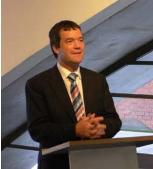
Noel Dempsey TD, Minister for Transport

We are pleased to announce that the Minister for Transport, Noel Dempsey, T.D. will be in Cork during European Mobility Week 2008 to officially launch both “GoCar” and “Avego”.