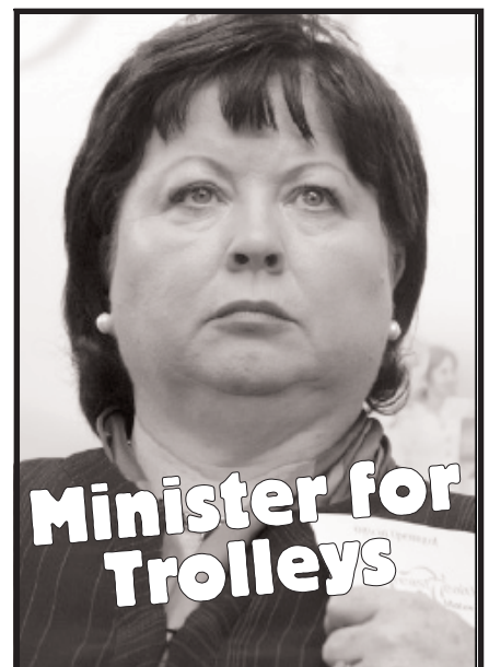
Minister for Trolleys

Now the government is running down public healthcare while building up private medicine. Here in Limerick the government is helping their big business buddies build two new private hospitals. This all part of the governments big co-location and privatisation plans.